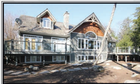
LAND YOUR HELI ON YOUR DOCK $4.3M