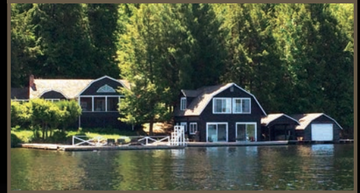
SOUTH LAKE ROSSEAU - $3,995,000