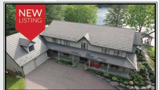
MUSKOKA RIVER ESTATE $1.195M