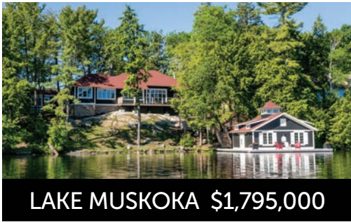
LAKE MUSKOKA $1,795,000