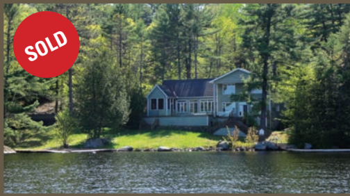
LAKE MUSKOKA $949,000

Don't let your property be lost in a sea of sameness! I WILL SET IT APART! With over 28 years of experience, MY LISTINGS SELL! Call me for your personal confidential evaluation.