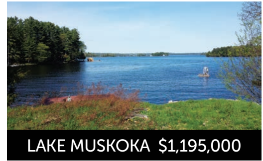
LAKE MUSKOKA $1,195,000

JACK GAINES, Sales Representative 705-641-8006 jackgaines@sympatico.ca