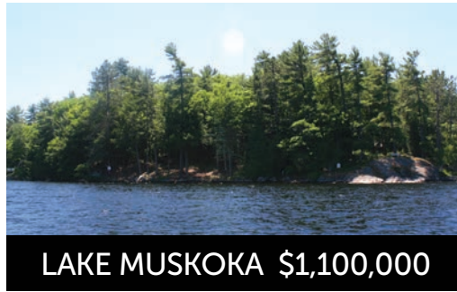
LAKE MUSKOKA $1,100,000

JACK GAINES, Sales Representative 705-641-8006 jackgaines@sympatico.ca