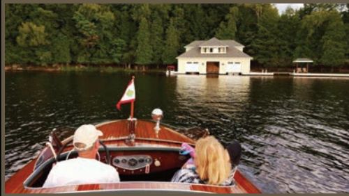
LAKE MUSKOKA $4,225,000