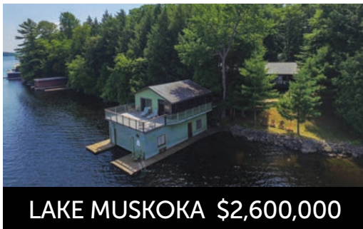
LAKE MUSKOKA $2,600,000