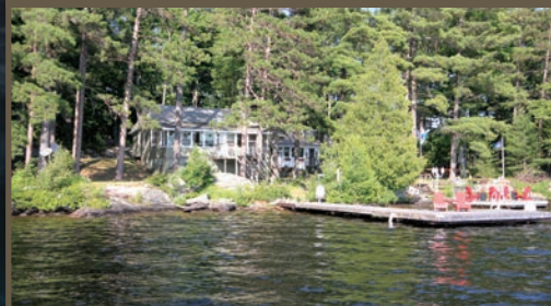
LAKE MUSKOKA - $399,000